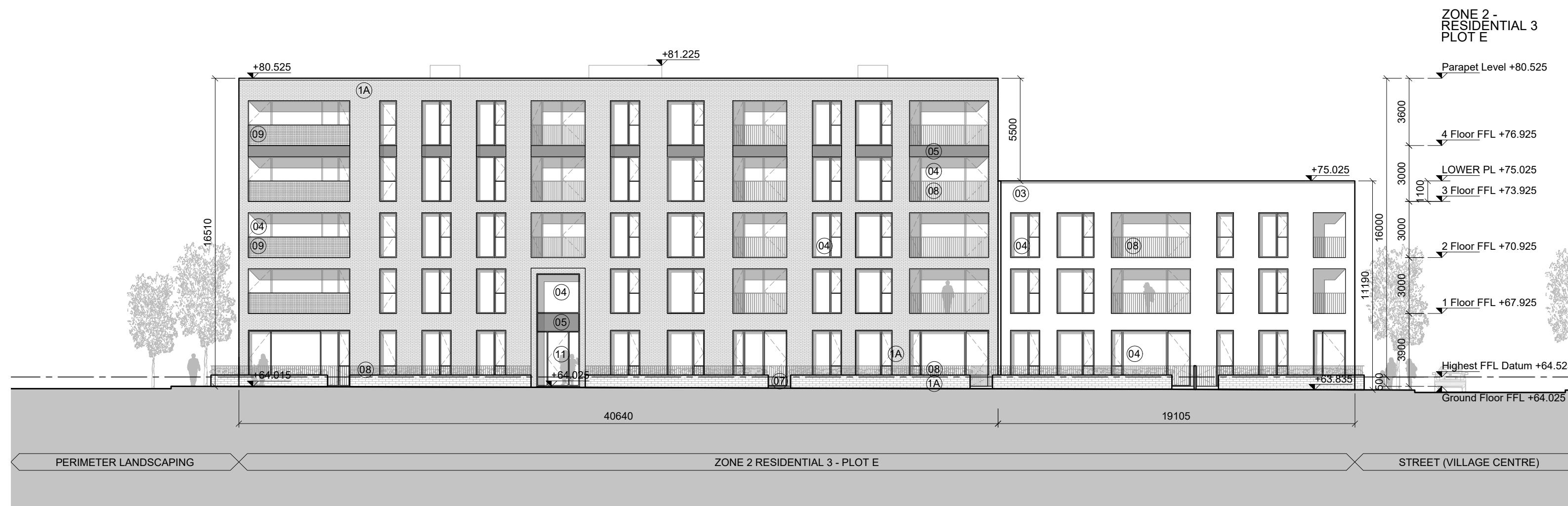
4 SOUTH EAST ELEVATION E400 SCALE: 1:200