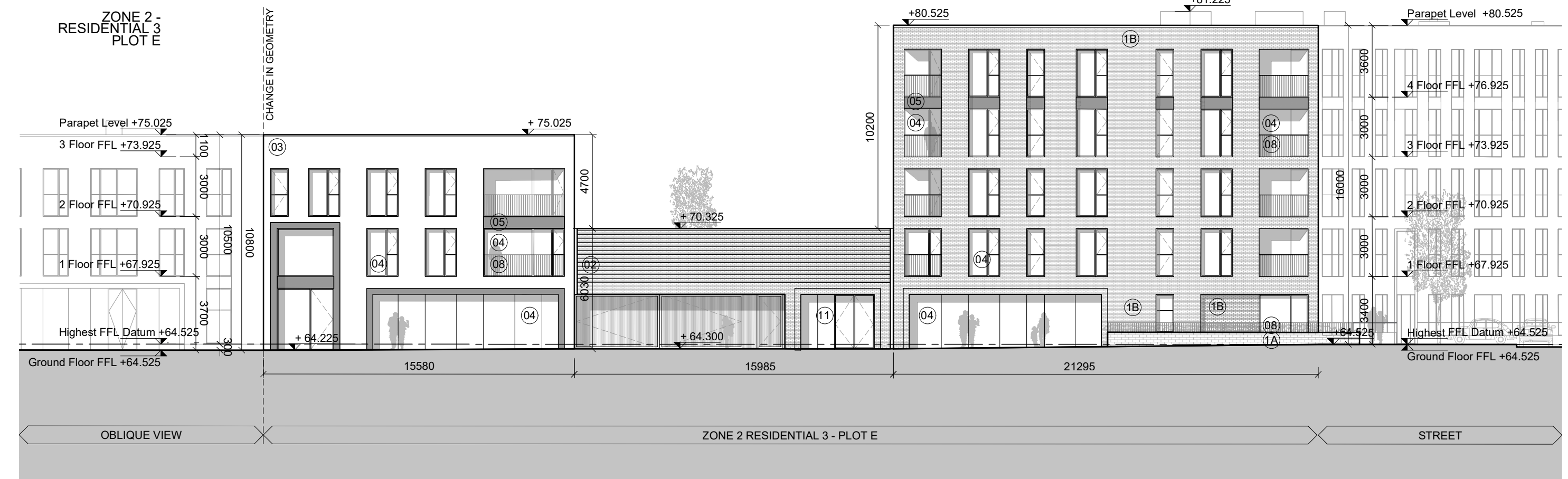
3 NORTH ELEVATION E400 SCALE: 1:200