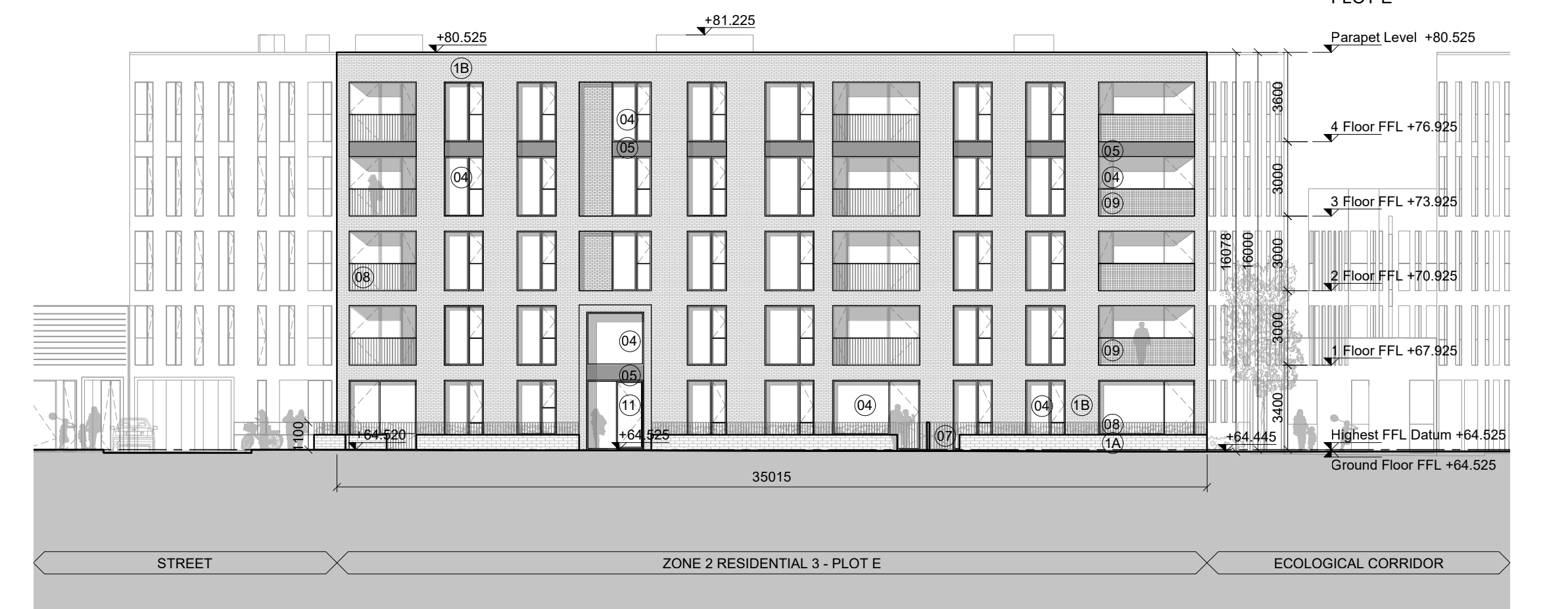
5 NORTH WEST ELEVATION E400 SCALE: 1:200