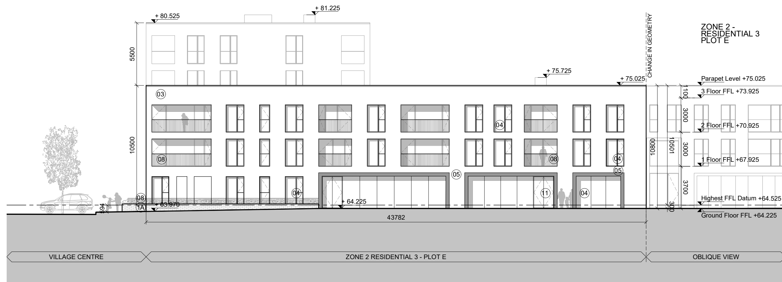
2 NORTH EAST ELEVATION E400 SCALE: 1:200